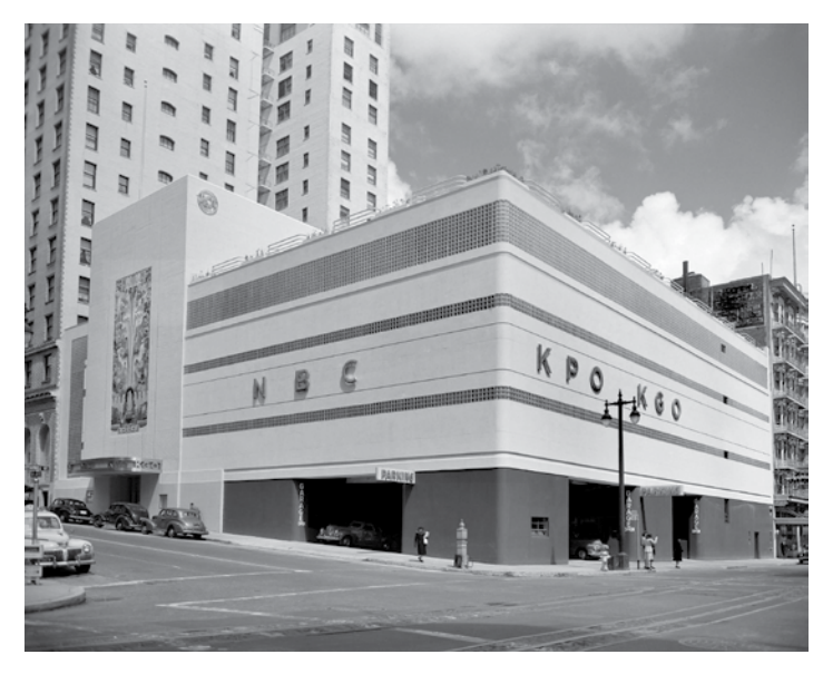
NBC Radio city 420 Taylor at O'Farrell

Network radio continued with live music broadcasting until the late 1950s. To learn more about the programs and personnel of the last decade, read my article in the August 2004 Musical News. E-mail me at the address below to get a copy. I was fortunate to have grown up in the last decade of live music radio and hope you have enjoyed reminiscing with me.