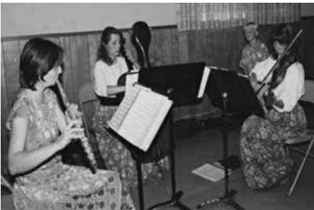
Playing at a family event in the mid-80s